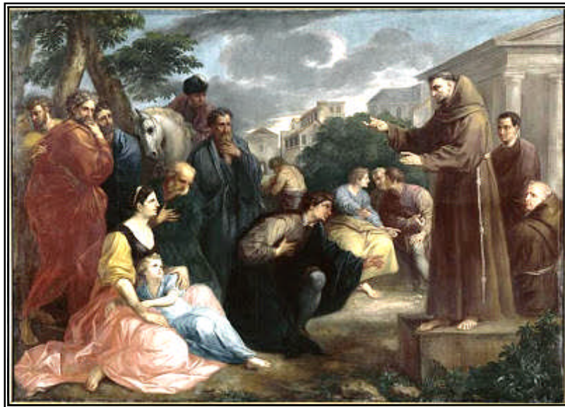
St. Anthony teaching the Faith

The words of Jeremias' Lamentation, six-hundred years before Christ (which are chanted each year on Good Friday during Tenebræ) are poignantly contemporary and applicable. Speaking of the children of God, the Prophet says: Her kings and her princes are