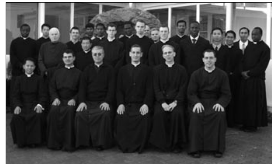
The Priests, Brothers and Seminarians of Holy Cross Seminary

The Popes have the grave responsibility of preserving and handing down, unmarred, the Sacred Deposit of Faith. We can confidently turn to the harmonious Magisterium of the Church to know what precisely is the Faith, what constitutes a danger to the Faith, and what best will promote the Faith. For this reason, Archbishop Lefebvre insisted upon a preliminary course in our Seminary curriculum which treats of the key Papal Encyclicals addressing the modern errors – to instil in the priests of