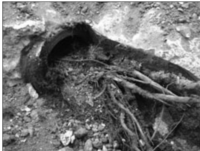
A root-filled clay pipe. These pipes are actually in daily use.