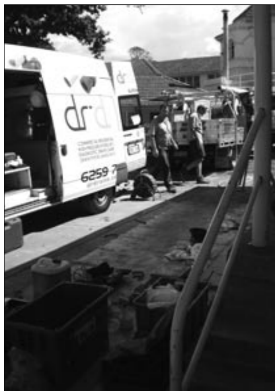
Work men repairing sewage lines underneath the Mater Dei Wing.