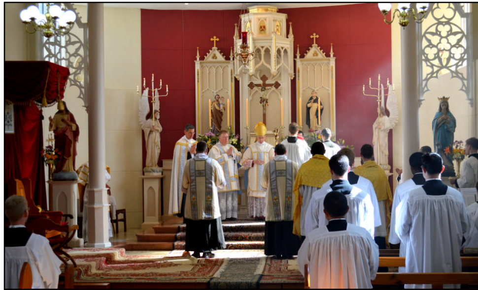
The Conclusion of the Pontifical Mass with the Tonsure and Minor Orders conferred upon our Seminarians

A cleric's responsibilities surround the Sacrifice of Christ at the altar and the Church's mission to draw the faithful ever closer to Our Lord. A relation exists between the clergy and the faithful, which necessitates a reciprocal solicitude for each other. Both cleric and layman must, by prayer and rectitude of life, spiritually fortify one another in order to draw ever closer to Christ. The seminarians must conceive and guard this reality in order to not fall sway to a false notion of their role as clerics and ministers in Christ's Church. Seminarians must become other Christs living in our midst according to the perfect Ideal seen in Our Lord Jesus Christ, Who came for the Salvation of men.