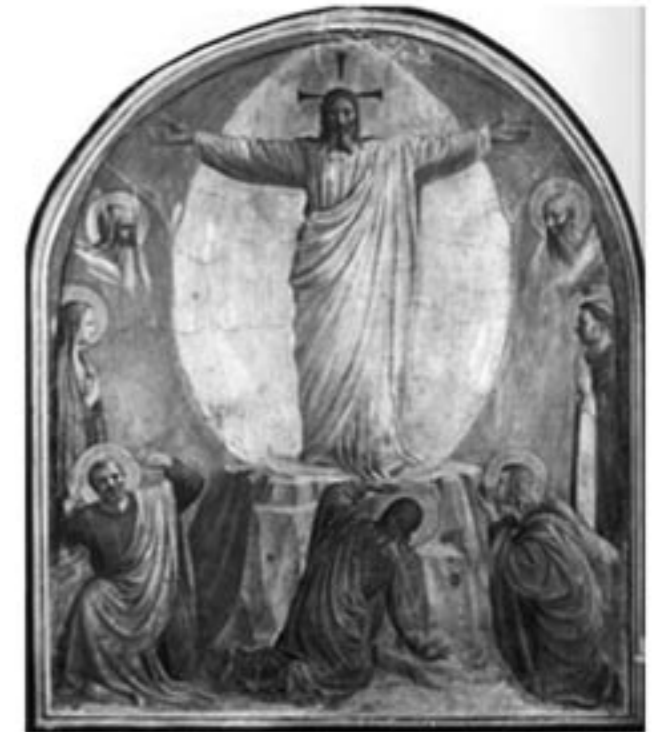
The Transfiguration by Fra Angelico

God is infinitely wise and seeks to order all things to perfect goodness. Man has the responsibility to conform to this true pattern of goodness in which he