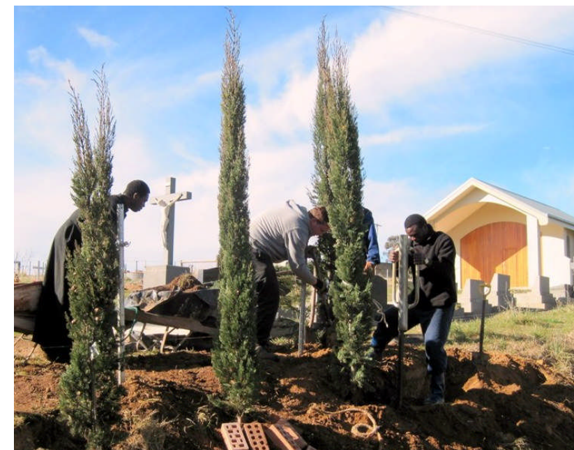
Improvements on the Cemetery Landscaping

So many souls are lost because they do not see Christ in this world, they do not have grace to withstand the lure of the world, they do not have encouragement to hope for eternal joy. Most have only high-tech, eye-catching, pop-culture advertisements