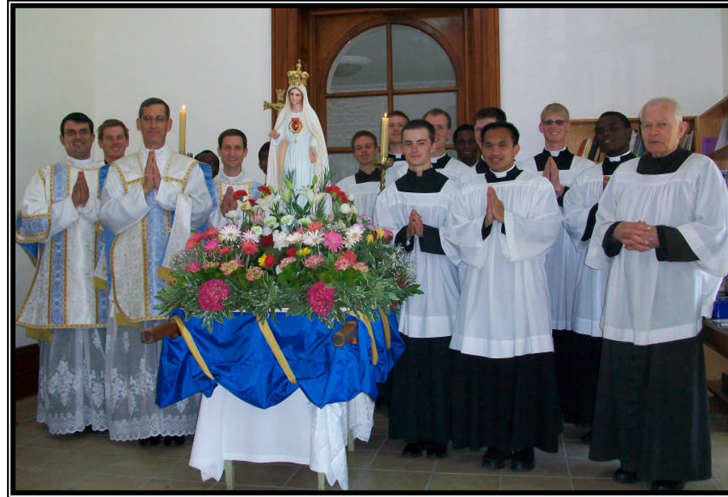
After the Ceremonies on the Feast of the Immaculate Conception of the Blessed Virgin Mary