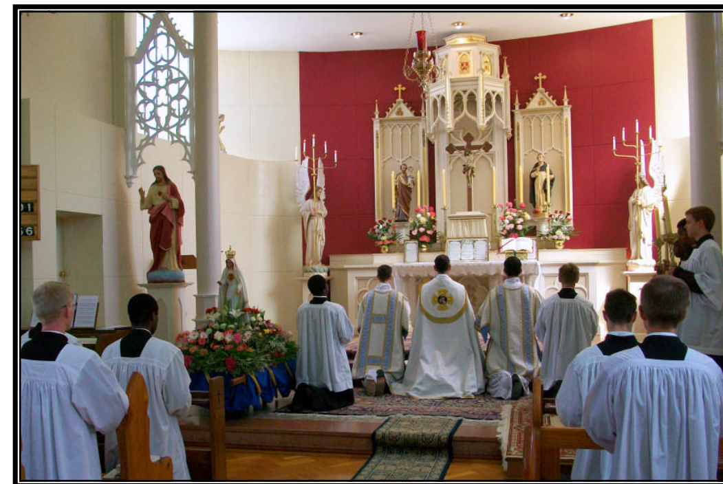
The Procession was preceded by the chanting of the Litany of the Blessed Virgin Mary

This happy day also included the presentation of the spiritual bouquets of many who have been praying, sacrificing and striving to live more virtuous lives for many holy vocations. This offering made on Our Lady's Feastday must please our Queen, the Throne of Grace , who, we confidently expect, will certainly move more young women and men to take that generous step to offer themselves in the loving service of Religion or the Priesthood. Thank you very much for supporting the Vocations Crusade, which will certainly enrich Holy Cross Seminary – may God grant us many holy priests.