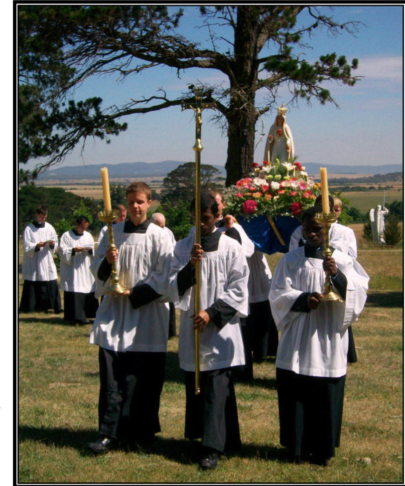
The Crusade for Vocations under the Banner of the Immaculate Heart of Mary

The aspirant replies that he desires to spend himself in the work of Holy Mother Church and in the bosom of the Priestly Society of St. Pius X: With the