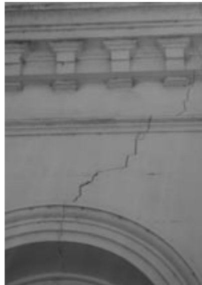
A number of arched windows and doorways have potential for failure due to the worsening cracks.