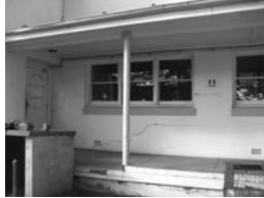
Outside the Seminary Kitchen, cracks run in all directions on the Mater Dei Wing.