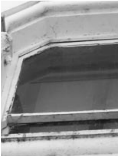
Weathered windows allow insects and dust to make their way into the Seminary Buildings.