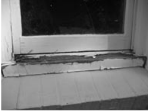
This, like many of the old windows in the Seminary, have seen better days – in the winter months they do not keep out the winter cold.

Work is in progress to repair the many structural problems which have developed in the Seminary buildings' foundations and walls. The Seminary also hopes to replace many old windows on the premises so as to improve heating efficiency in the winter months. Current estimates to accomplish all these repairs and replacements amount to over $200,000! God willing, we will do what we are able. Please help us. Thank you and God bless you.