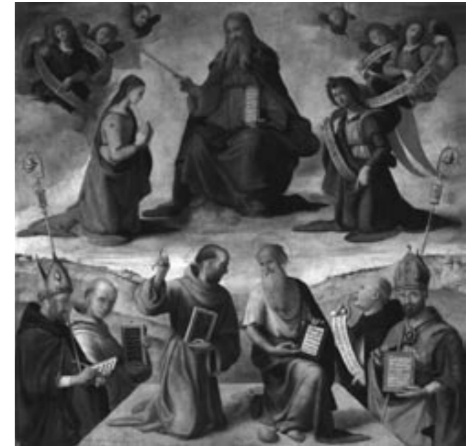
Immaculate Conception with Saints, by Piero di Cosimo (1462-1521)

The priest forsakes companionship with family, friends, home and country in order to live familiarly in the company