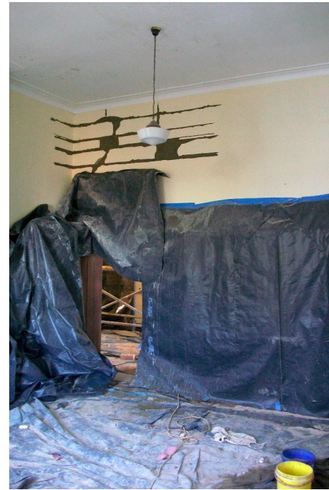
The Spirituality Classroom