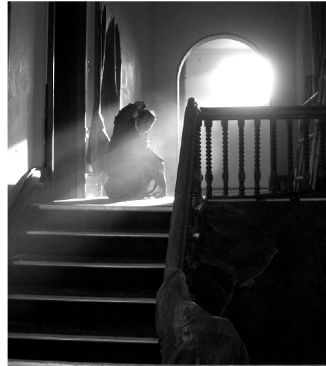
After a long day of work