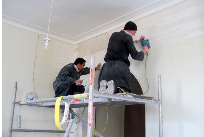
Sanding the scars left by the repairs