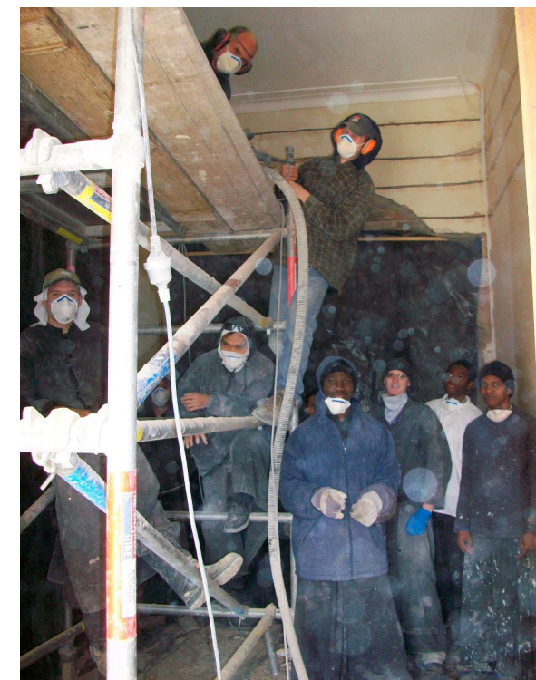
Brothers and Seminarians pose in their dusty work

Additionally, in order to secure a lasting and sufficient water source for the operation of the Seminary property, a bore was drilled and an application lodged before new legislation would forbid the acquisition of new ground water licences. A substantial source was tapped and we now await the NSW Office of Water to grant the acquisition rights. Please pray for this intention.