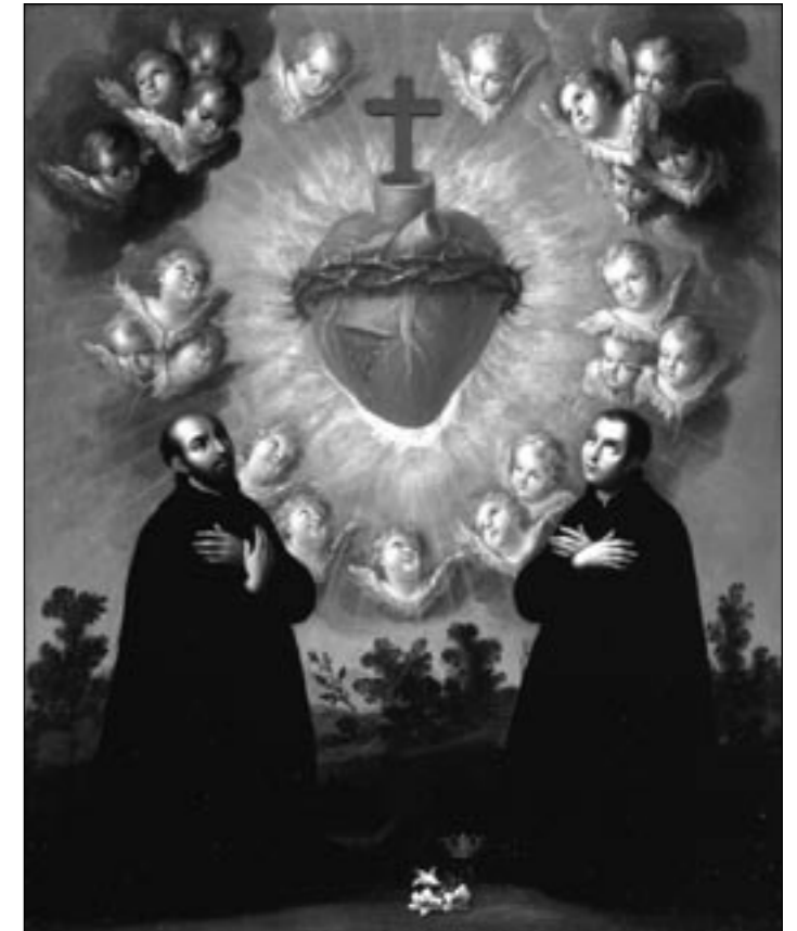
Sacred Heart of Jesus with Saint Ignatius of Loyola and Saint Louis Gonzaga, c. 1770, by José de Páez

Psalm sixty-eight, from which the Offertory of the Mass of the Sacred Heart of Jesus is taken, urges us to contemplate Christ's sorrow and suffering, all for the love of men, despite our rebellious behaviour. This mournful critique of our love for God, our appreciation of Our Lord's Passion, is a call to greater love and generosity in our devotion, our fidelity to living the example Christ has given us.