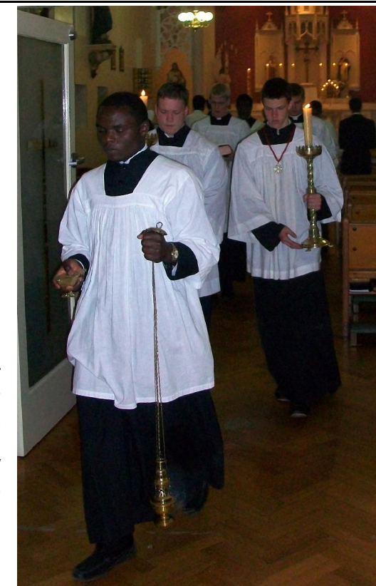
Recession after Sunday Vespers

Although many are familiar with St. Louis de Montfort's doctrine on Our on Our Lady's exceptional role in the salvation of souls, the Total Consecration to Mary , few genuinely live this devotion, says the Saint. This secret reveals a simpler and more certain path to holiness by an act of complete giving of self to Our Lady so as to more easily be drawn near to God and His perfection. There is no magical formula to bring about the transformation of a sinner to a saint, but the simpler way is by the wilful, humble and confident slavery to Our Lady.