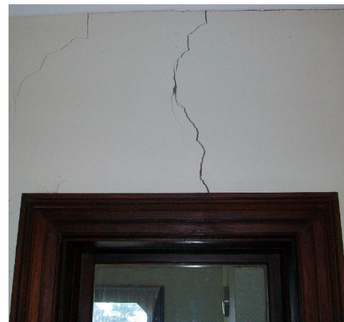
Please help us repair the damaged walls in the classrooms and corridors at Holy Cross Seminary.