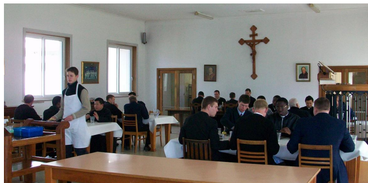
The Community Meal

We must ask ourselves: “Why am I counted among those who know and have the opportunity to eternal life? What have I done to deserve this privilege?” Considering the malice of sin, our cooperation in sin and God’s gentle and merciful love,