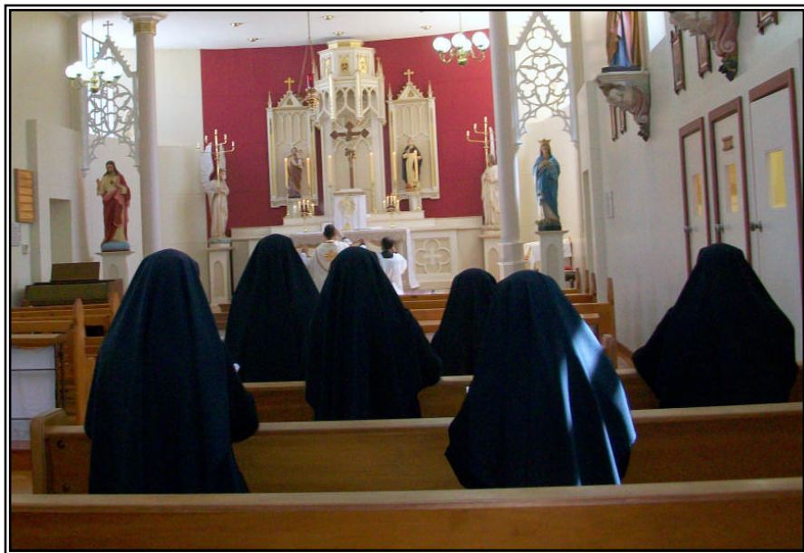
The Society Sisters adoring the Blessed Sacrament at the close of their annual Retreat

Then, is it not our Christian duty to pray for many, holy vocations? This duty faithfully